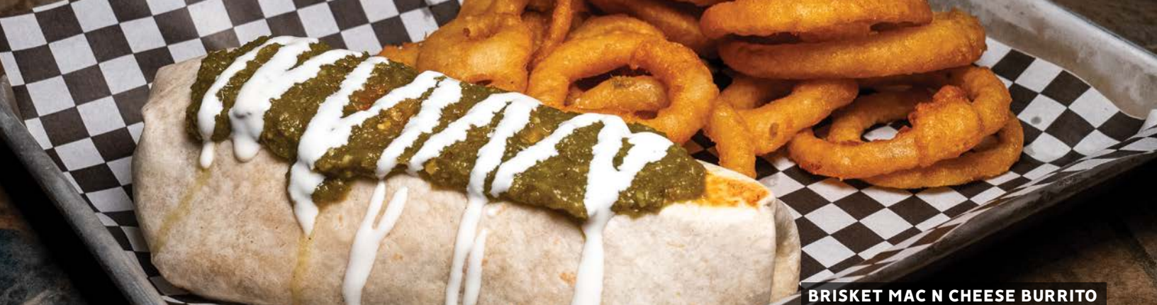
BRISKET MAC N CHEESE BURRITO